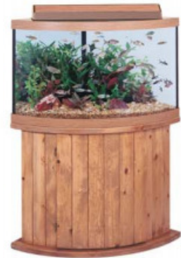
Bow-Front Corner Aquarium